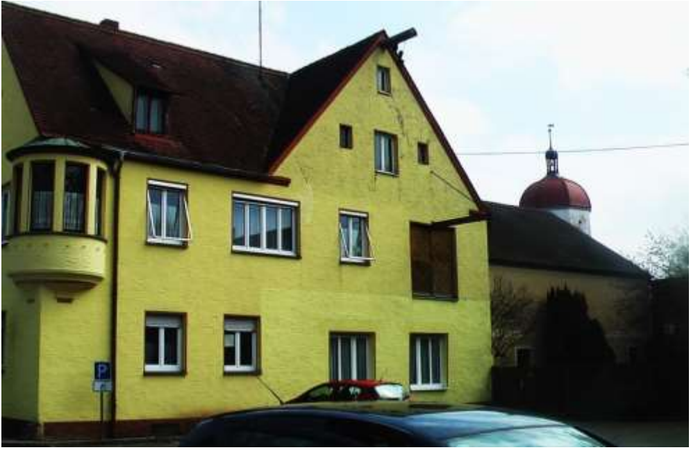
<u>The former synagogue in Oettingen</u>