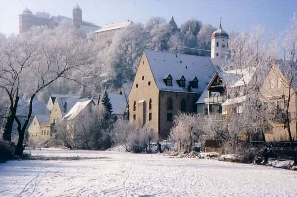
<u>Former Harburg Synagogue.</u> (The Harburg Castle can be seen on the hill in the background.)

However, there was also opposition in high places to the cultural centre, and political pressure resulted in its closure in 1992.