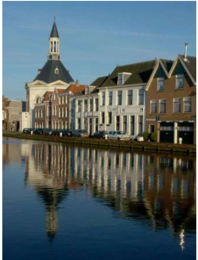
Houses in Leidschendam, alongside the Vliet