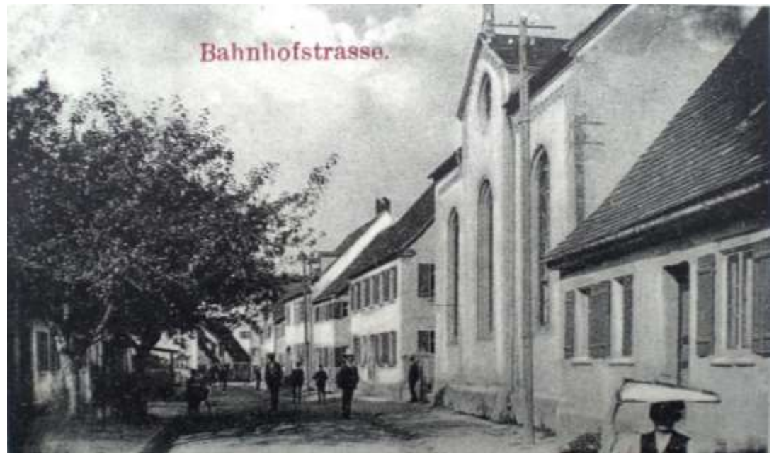
The Schopfloch synagogue in Bahnhofstrasse ("Railway Station Street), 1910

Schopfloch was the home town of my great(x4)grandparents Hayum Levi and Hindel (no surnames back then) from around 1787. They were the parents of Moses Haium Kronheimer (1791-1870). The community was probably founded by Jews expelled from Dinkelsbühl in 1400. Its cemetery served 14 neighbouring communities (including Wittelshofen) in the 16<sup>th</sup> -17<sup>th</sup> centuries. After the town was annexed to Bavaria in 1608, the Jews were under the authority of the counts of Brandenburg and the rulers of Oettingen. The Jewish population reached a peak of 393 in 1867 (out of a total 1,788) and a new synagogue was built in 1877. In 1880 the Jewish population was 147 and in 1933, 37. In the Nazi era, some Jews left before mid-1938, but with anti-Jewish agitation rising, the last 27 left for other German cities. (Information from www.allemania-judaica)