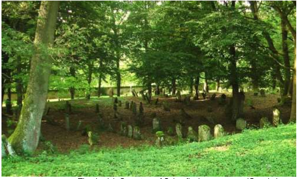
The Jewish Cemetery of Schopfloch

Schopfloch was the home town of my great(x4)grandparents Hayum Levi and Hindel (no surnames back then) from around 1787. They were the parents of Moses Haium Kronheimer (1791-1870). The community was probably founded by Jews expelled from Dinkelsbühl in 1400. Its cemetery served 14 neighbouring communities (including Wittelshofen) in the 16<sup>th</sup> -17<sup>th</sup> centuries. After the town was annexed to Bavaria in 1608, the Jews were under the authority of the counts of Brandenburg and the rulers of Oettingen. The Jewish population reached a peak of 393 in 1867 (out of a total 1,788) and a new synagogue was built in 1877. In 1880 the Jewish population was 147 and in 1933, 37. In the Nazi era, some Jews left before mid-1938, but with anti-Jewish agitation rising, the last 27 left for other German cities. (Information from www.allemania-judaica)