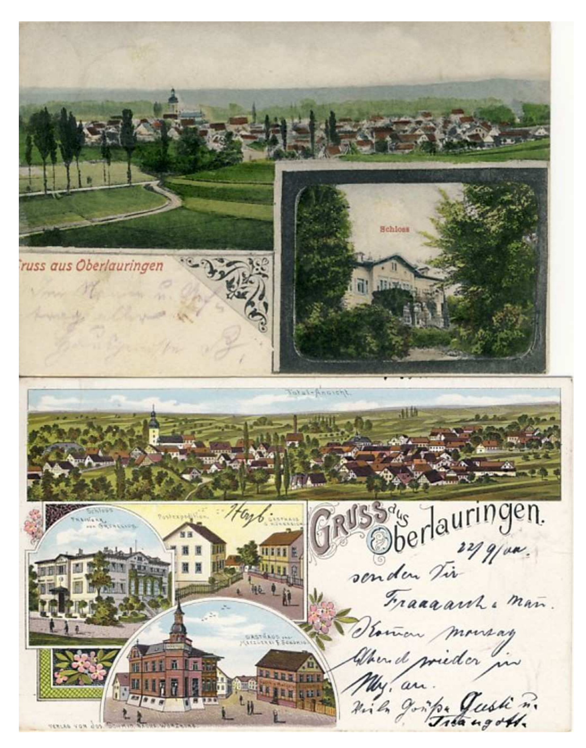
Postcards of Oberlauringen about 1900