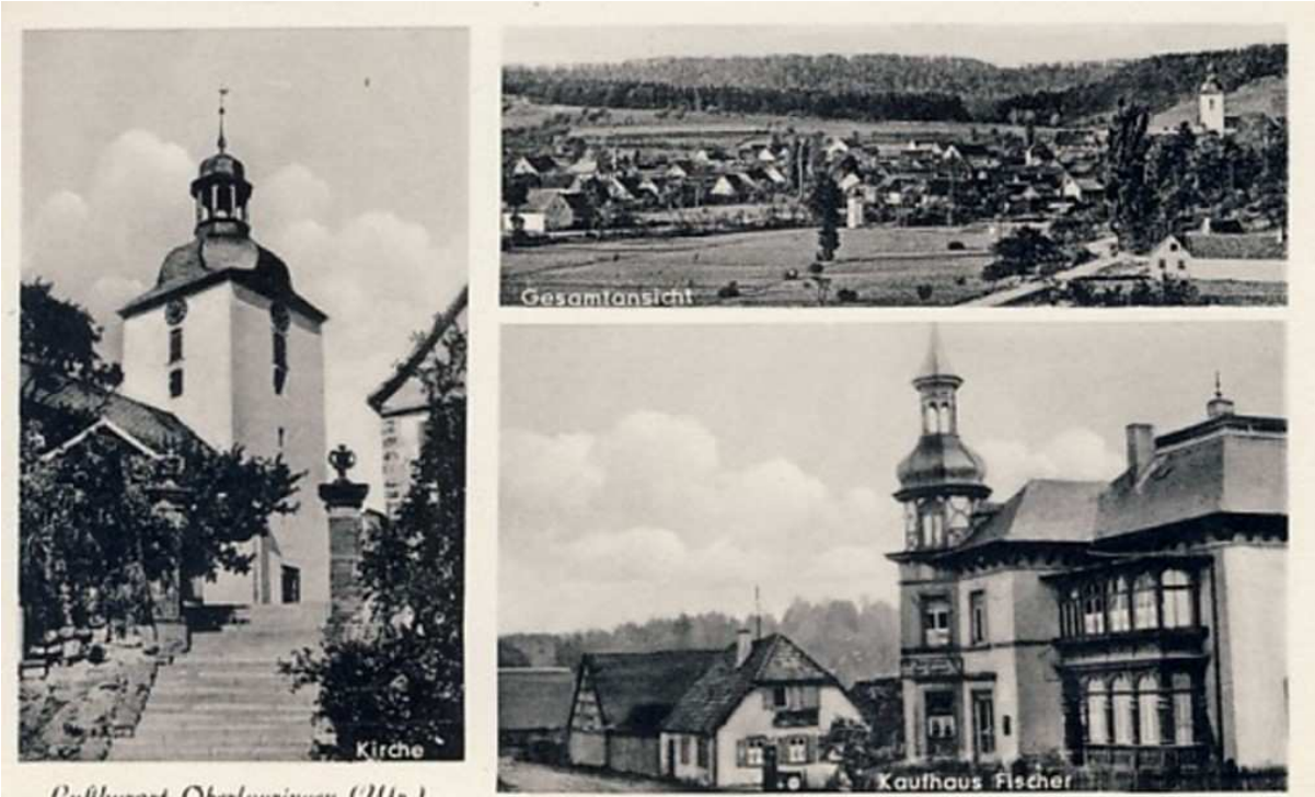
Luftkurort Oberlauringen (1141.)

With the National Socialists this tolerance disappeared. Many Jews left the village. 30 Jews could leave the place and emigrate between 1937 and 1940. The last 13 o them and two from Stadtlauringen had to live in a ghetto house of the family Seegen very crampedly. On April 25<sup>th</sup>, 1942 they were collected an deported to Lublin via Wurzburg with the general transport Nr, DA 49. Nobody survived.